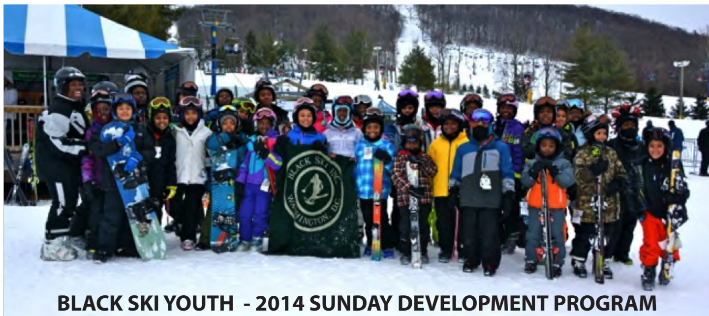
BLACK SKI YOUTH - 2014 SUNDAY DEVELOPMENT PROGRAM